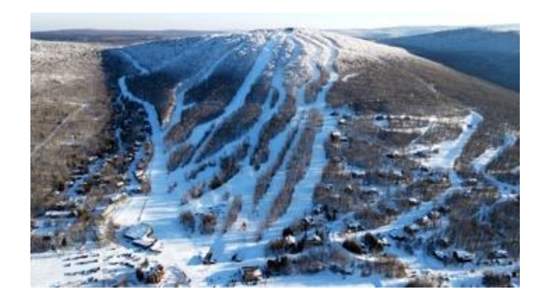
Staying in 2 houses right on the slopes Ski In/Ski Out

1 bedroom still available Couch and floor spots available!