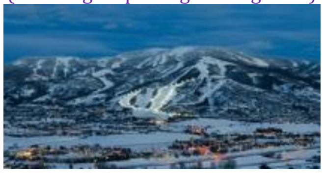
Snowshoe/Silvercreek January 5-7 2024 (possible, not reserved yet)