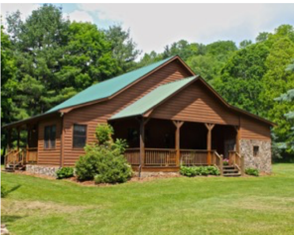
The Homeplace Cabin

Staying in 2 cabins right on Helton Creek in Lansing, NC (only a few miles from the trail access in Whitetop).