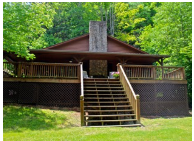
The Hideaway Cabin